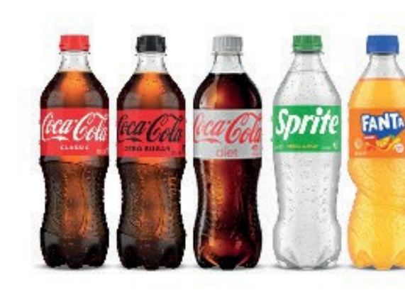
Coca-Cola 600mL Variety $ 1 90