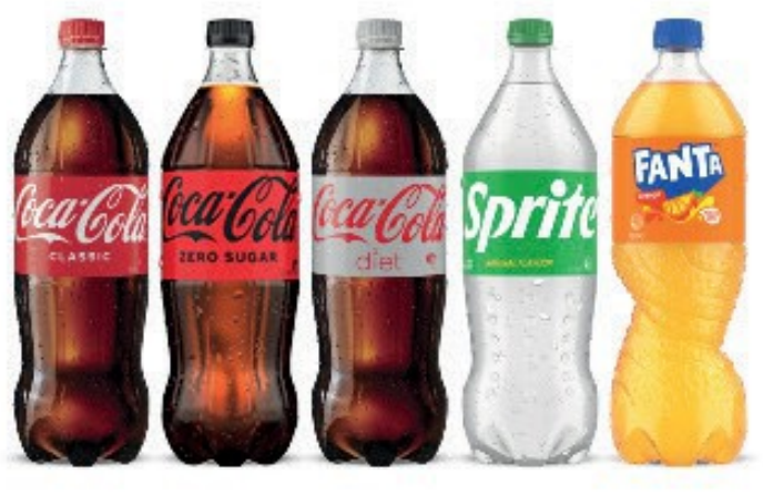
Coca-Cola 1.25L Variety $5 90